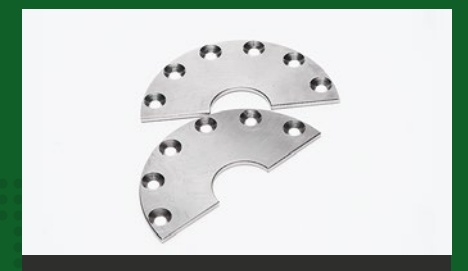
Set of scraper plates for specific wire diameter