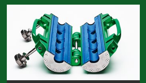
Set of seals for specific wire diameter