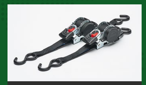
Self retracting ratchet straps for attaching chamber