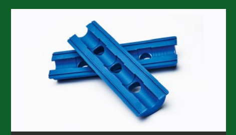
Spare set of seals