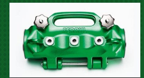
Lightweight aluminium lubricating chamber